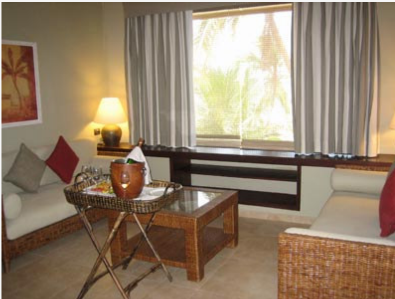
Suite living room area.